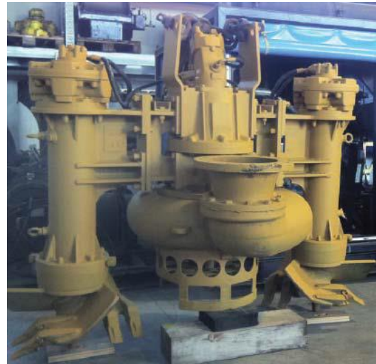
Pump with agitator