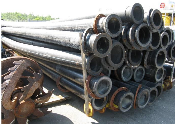
Pipes for output