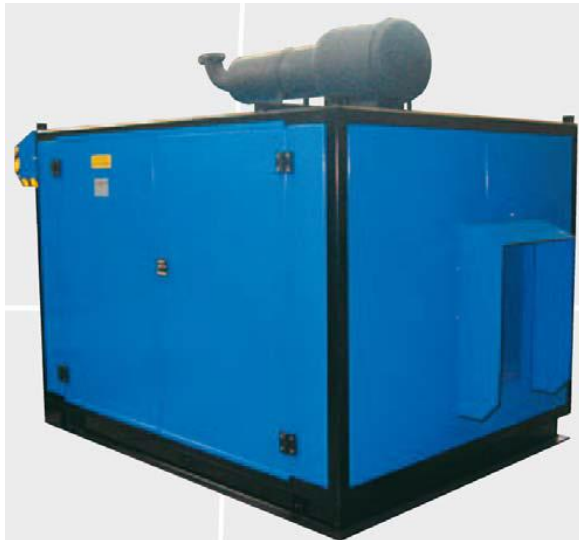
Diesel Power Unit